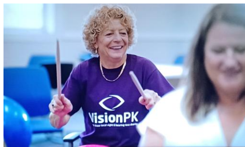
Image shows 2 females smiling with one playing the drums wearing a VisionPK T shirt.

We're delighted to share that we were fortunate to receive funding from the SSEN Community Connections Fund this year.