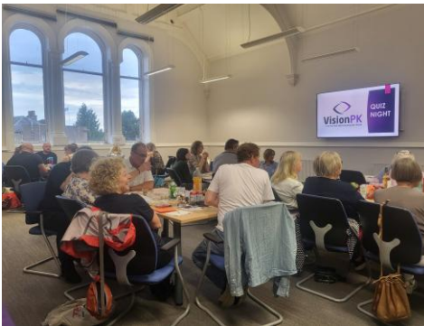
Image shows a large group of people sitting at tables taking part in a quiz night.

Following the success of our August quiz night, we're back with another fantastic Quiz Night on Friday 14 November – doors 7pm, quiz starts at 7.30pm