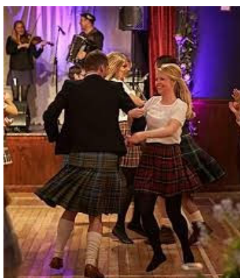
Photo shows man and woman in kilts dancing with band playing in the back ground

We are going to hold our first ceilidh in our beautiful Atrium on Friday 6 th June from 7pm to midnight. Enjoy music from the Blackford Fiddlers and delicious stovies will be served. Alcohol and soft drinks can be purchased throughout the evening. Tickets are £20 per person. Get yours early as it's going to be a sell out! All ticket sales and funds raised on the evening support our work so get your family and friends together and come along for a great evening of dancing and fun.