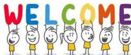
Photo shows cartoon images of people holding a multi-coloured welcome sign

Join us in welcoming our new staff to the VisionPK Team: